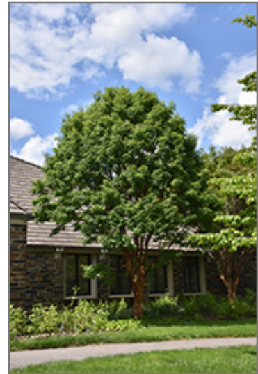
Paperbark Maple