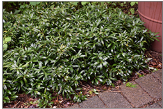
Himalayan Sweet Box

Himalayan Sweet Box is recommended for the following landscape applications;