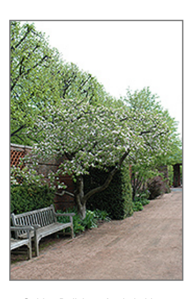
Golden Delicious Apple in bloom

* This is a 'special order' plant - contact store for details