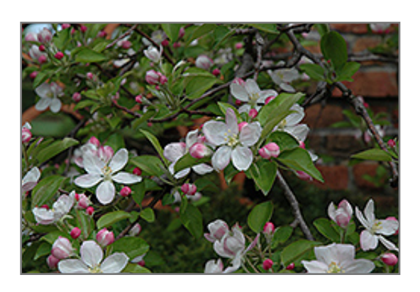
Golden Delicious Apple flowers