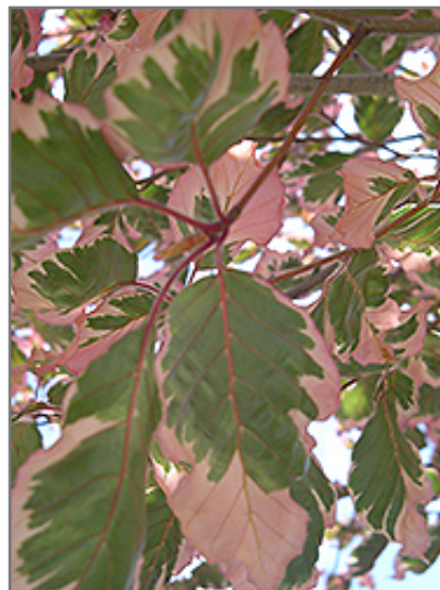
Tricolor Beech foliage