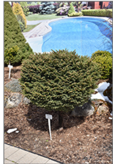
Little Gem Spruce (tree form)