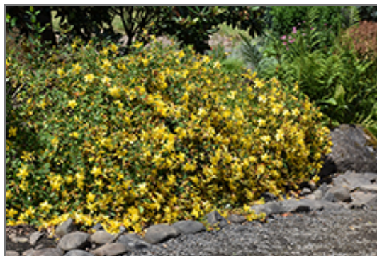
Hidcote St. John's Wort in bloom