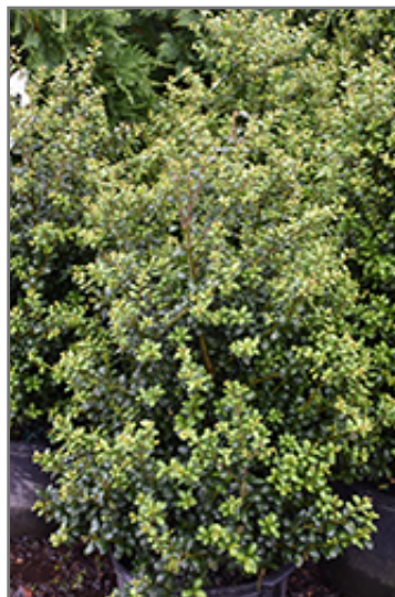
Chesapeake Japanese Holly