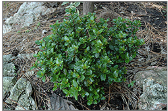
Little Rascal Meserve Holly