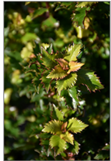
Little Rascal Meserve Holly foliage