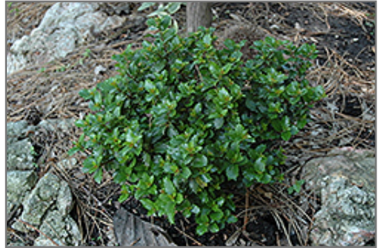
Little Rascal Meserve Holly