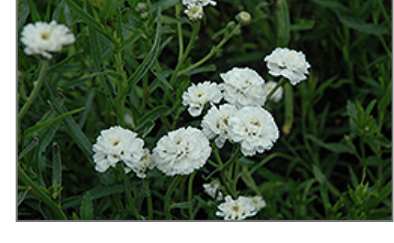
Noblessa Achillea flowers

Noblessa Achillea is smothered in stunning balls of white flowers at the ends of the stems from early to late summer. The flowers are excellent for cutting. Its attractive tomentose ferny leaves remain dark green in color throughout the season.