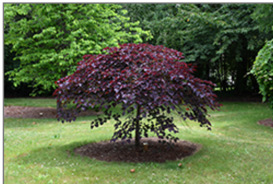
Ruby Falls Redbud

Ruby Falls Redbud will grow to be about 8 feet tall at maturity, with a spread of 6 feet. It has a low canopy with a typical clearance of 1 foot from the ground, and is suitable for planting under power lines. It grows at a medium rate, and under ideal conditions can be expected to live for 60 years or more.