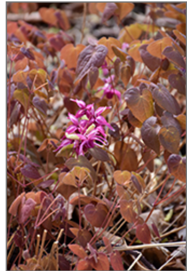
Yubae Bishop's Hat flowers