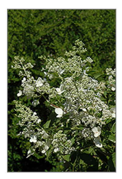
White Lace Hydrangea flowers

White Lace Hydrangea will grow to be about 15 feet tall at maturity, with a spread of 10 feet. It tends to be a little leggy, with a typical clearance of 1 foot from the ground, and is suitable for planting under power lines. It grows at a medium rate, and under ideal conditions can be expected to live for 40 years or more.