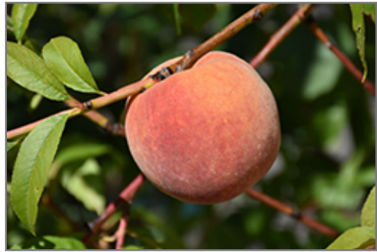
Redhaven Peach fruit

Redhaven Peach is covered in stunning clusters of fragrant pink flowers along the branches in early spring, which emerge from distinctive rose flower buds before the leaves. It has dark green deciduous foliage. The narrow leaves turn yellow in fall. The fruits are showy yellow drupes with a red blush, which are carried in abundance in mid summer. The fruit can be messy if allowed to drop on the lawn or walkways, and may require occasional clean-up.