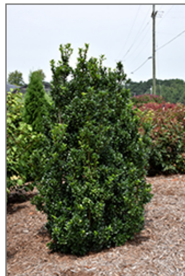
Castle Wall Meserve Holly