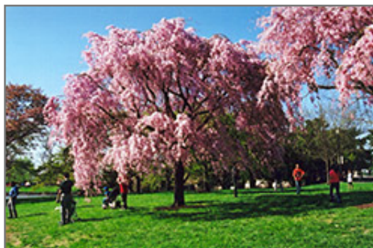
Pink Weeping Higan Cherry in bloom