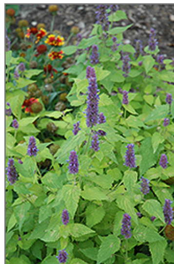
Golden Jubilee Anise Hyssop flowers

This is a relatively low maintenance plant, and is best cleaned up in early spring before it resumes active growth for the season. It is a good choice for attracting bees, butterflies and hummingbirds to your yard, but is not particularly attractive to deer who tend to leave it alone in favor of tastier treats. It has no significant negative characteristics.