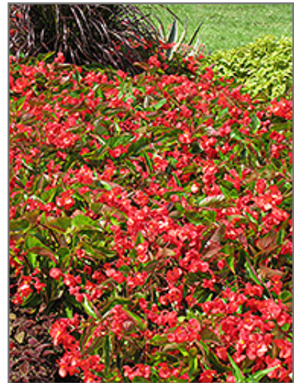
Dragon Wing Red Begonia in bloom