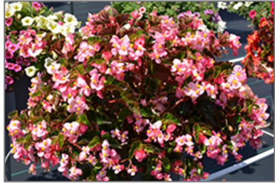
BabyWing Pink Begonia in bloom

BabyWing Pink Begonia is a fine choice for the garden, but it is also a good selection for planting in outdoor containers and hanging baskets. It is often used as a 'filler' in the 'spiller-thriller-filler' container combination, providing a mass of flowers and foliage against which the thriller plants stand out. Note that when growing plants in outdoor containers and baskets, they may require more frequent waterings than they would in the yard or garden.