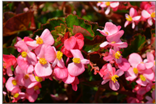
BabyWing Pink Begonia flowers