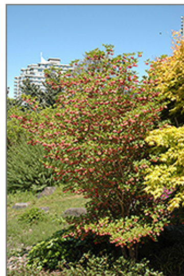
Redvein Enkianthus in bloom