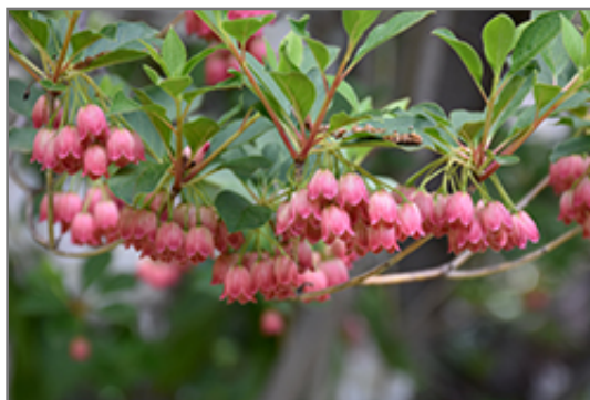
Redvein Enkianthus flowers