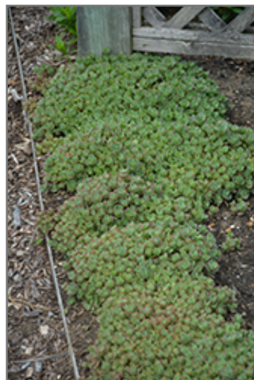
Lime Zinger Stonecrop

Lime Zinger Stonecrop will grow to be only 4 inches tall at maturity extending to 6 inches tall with the flowers, with a spread of 18 inches. When grown in masses or used as a bedding plant, individual plants should be spaced approximately 15 inches apart. Its foliage tends to remain low and dense right to the ground. It grows at a fast rate, and under ideal conditions can be expected to live for approximately 15 years. As an herbaceous perennial, this plant will usually die back to the crown each winter, and will regrow from the base each spring. Be careful not to disturb the crown in late winter when it may not be readily seen!