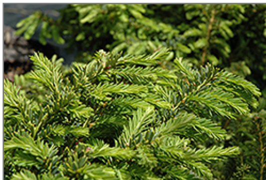
Emerald Spreader Yew foliage