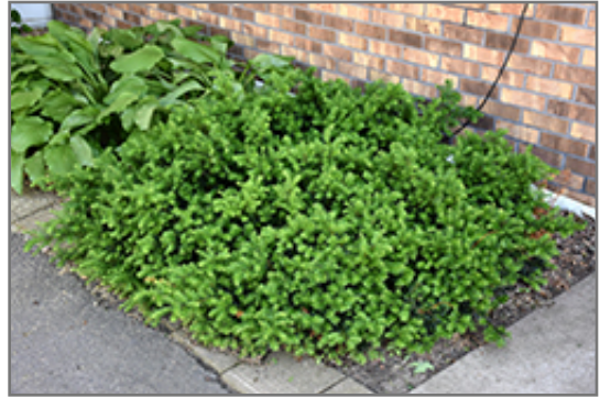
Emerald Spreader Yew

This shrub performs well in both full sun and full shade. However, you may want to keep it away from hot, dry locations that receive direct afternoon sun or which get reflected sunlight, such as against the south side of a white wall. It does best in average to evenly moist conditions, but will not tolerate standing water. It is not particular as to soil type or pH. It is highly tolerant of urban pollution and will even thrive in inner city environments, and will benefit from being planted in a relatively sheltered location. Consider applying a thick mulch around the root zone in winter to protect it in exposed locations or colder microclimates. This is a selected variety of a species not originally from North America, and parts of it are known to be toxic to humans and animals, so care should be exercised in planting it around children and pets.