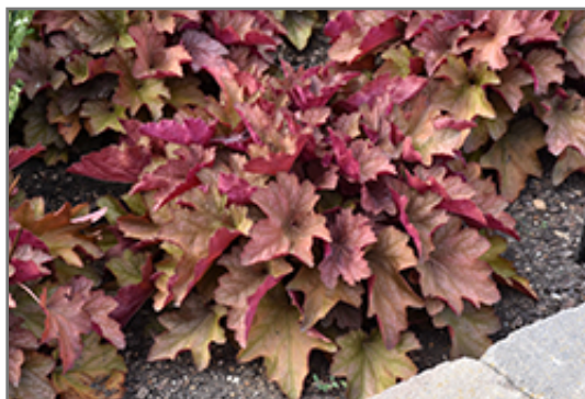
Carnival Watermelon Coral Bells