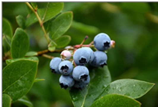
Northcountry Blueberry fruit

Northcountry Blueberry features dainty clusters of white bell-shaped flowers with shell pink overtones hanging below the branches in mid spring. It has green deciduous foliage. The glossy oval leaves turn an outstanding scarlet in the fall. It features an abundance of magnificent blue berries in mid summer.