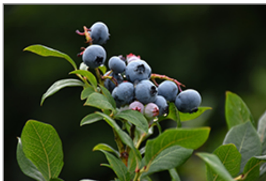
Northland Blueberry fruit