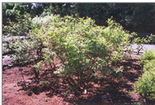
Northland Blueberry