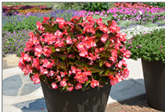
Surefire Red Begonia in bloom