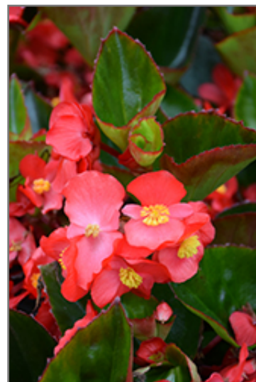
Surefire Red Begonia flowers

This is a relatively low maintenance plant, and usually looks its best without pruning, although it will tolerate pruning. Deer don't particularly care for this plant and will usually leave it alone in favor of tastier treats. Gardeners should be aware of the following characteristic(s) that may warrant special consideration;