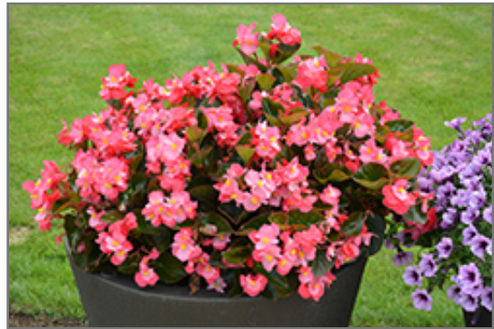
Surefire Rose Begonia in bloom