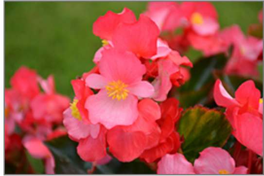
Surefire Rose Begonia flowers

Surefire Rose Begonia is an herbaceous annual with an upright spreading habit of growth. Its medium texture blends into the garden, but can always be balanced by a couple of finer or coarser plants for an effective composition.