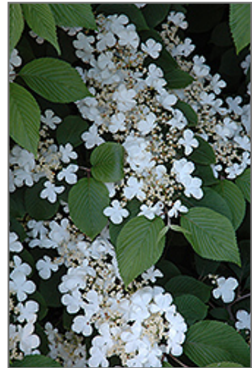
Maries Doublefile Viburnum flowers