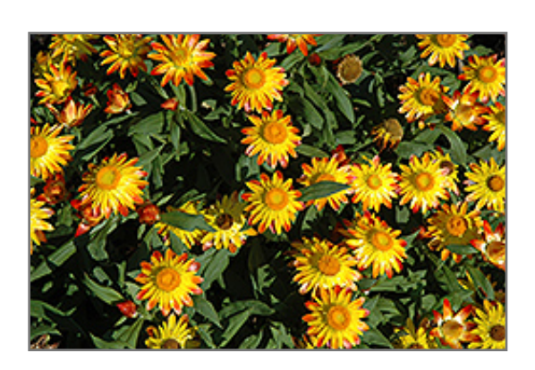
Sundaze Flame Strawflower flowers