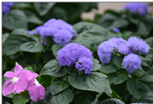
High Tide Blue Flossflower flowers