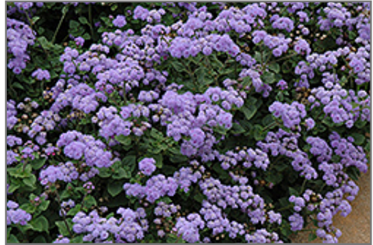
High Tide Blue Flossflower in bloom

High Tide Blue Flossflower will grow to be about 18 inches tall at maturity, with a spread of 16 inches. When grown in masses or used as a bedding plant, individual plants should be spaced approximately 12 inches apart. Its foliage tends to remain dense right to the ground, not requiring facer plants in front. This fast-growing annual will normally live for one full growing season, needing replacement the following year.