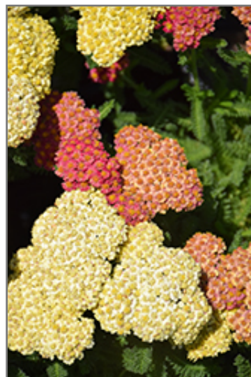
Desert Eve Terracotta Yarrow flowers

Desert Eve Terracotta Yarrow is recommended for the following landscape applications;