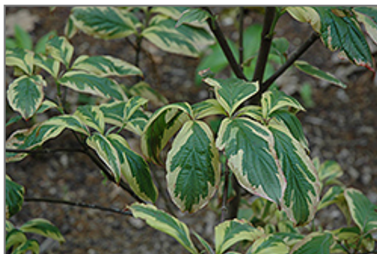
Firebird Flowering Dogwood foliage