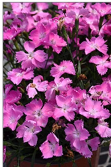
Beauties Kahori Pink Pinks flowers