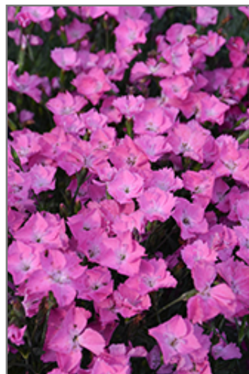
Beauties Kahori Pink Pinks flowers

Beauties Kahori Pink Pinks is recommended for the following landscape applications;