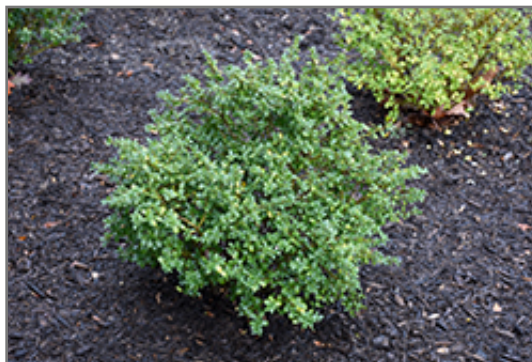
Green Lustre Japanese Holly