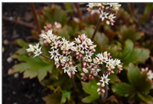
Karasuba Mukdenia flowers

85 CHIEF JUSTICE CUSHING HWY SCITUATE, MA 02066 781-545-1266