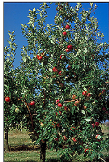
Zestar Apple fruit

* This is a 'special order' plant - contact store for details