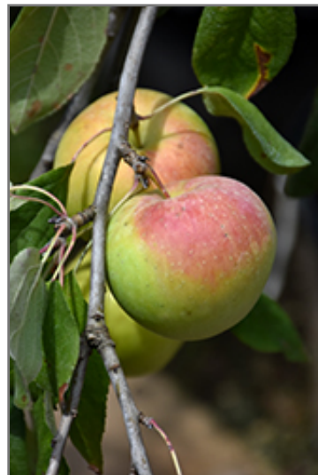
Zestar Apple fruit

Zestar Apple features showy clusters of lightly-scented white flowers with shell pink overtones along the branches in mid spring, which emerge from distinctive pink flower buds. It has forest green deciduous foliage. The pointy leaves turn yellow in fall. The fruits are showy red apples with hints of yellow, which are carried in abundance from late summer to early fall. The fruit can be messy if allowed to drop on the lawn or walkways, and may require occasional clean-up.