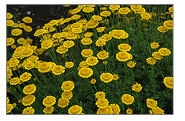
Charme Marguerite Daisy flowers