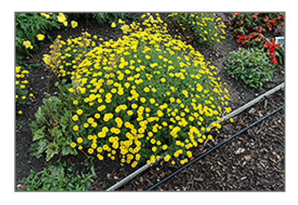
Charme Marguerite Daisy in bloom

85 CHIEF JUSTICE CUSHING HWY SCITUATE, MA 02066 781-545-1266 www.kennedyscountrygardens.com