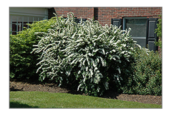
Renaissance Spirea in bloom