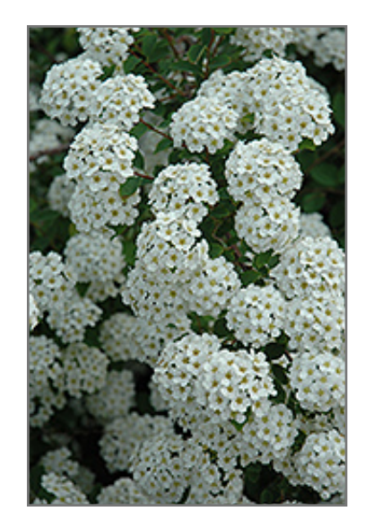
Renaissance Spirea flowers

85 CHIEF JUSTICE CUSHING HWY SCITUATE, MA 02066 781-545-1266 www.kennedyscountrygardens.com