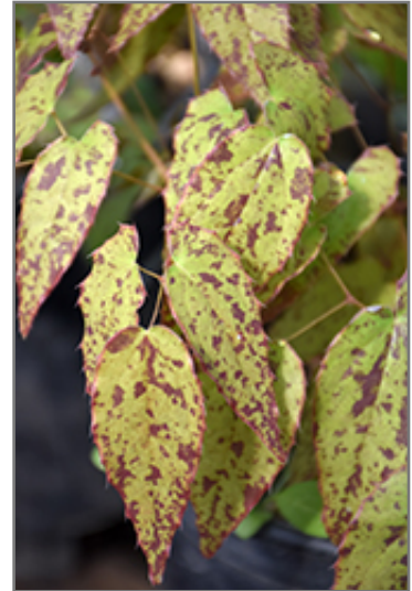
Pink Champagne Fairy Wings foliage

Pink Champagne Fairy Wings will grow to be about 12 inches tall at maturity extending to 16 inches tall with the flowers, with a spread of 24 inches. When grown in masses or used as a bedding plant, individual plants should be spaced approximately 18 inches apart. Its foliage tends to remain dense right to the ground, not requiring facer plants in front. It grows at a medium rate, and under ideal conditions can be expected to live for approximately 10 years. As an herbaceous perennial, this plant will usually die back to the crown each winter, and will regrow from the base each spring. Be careful not to disturb the crown in late winter when it may not be readily seen!