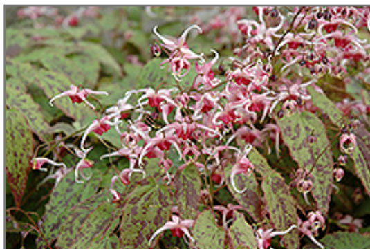
Pink Champagne Fairy Wings flowers