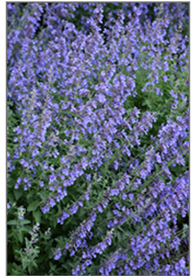
Cat's Meow Catmint flowers

Cat's Meow Catmint is recommended for the following landscape applications;