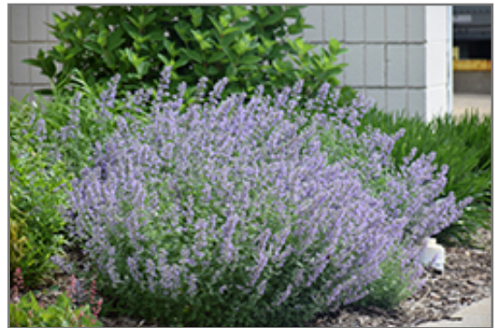
Cat's Meow Catmint in bloom