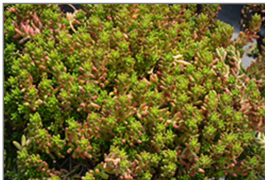
Jelly Bean Plant