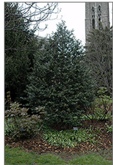
Centennial Girl Holly