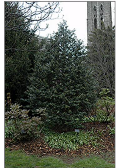
Centennial Girl Holly