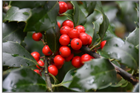
Centennial Girl Holly fruit