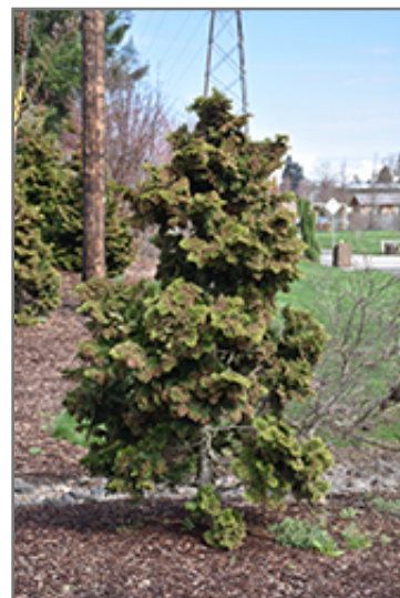
Koster's Falsecypress

Koster's Falsecypress makes a fine choice for the outdoor landscape, but it is also well-suited for use in outdoor pots and containers. Because of its height, it is often used as a 'thriller' in the 'spiller-thriller-filler' container combination; plant it near the center of the pot, surrounded by smaller plants and those that spill over the edges. It is even sizeable enough that it can be grown alone in a suitable container. Note that when grown in a container, it may not perform exactly as indicated on the tag - this is to be expected. Also note that when growing plants in outdoor containers and baskets, they may require more frequent waterings than they would in the yard or garden.