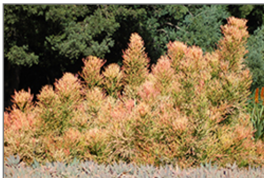
Sticks On Fire Red Pencil Tree