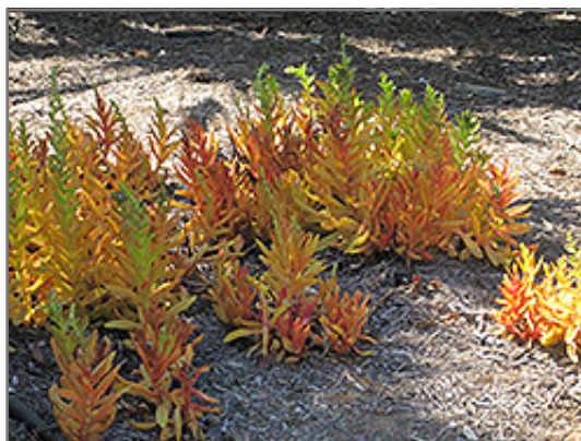
Campfire Crassula