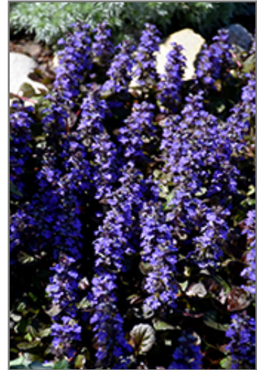
Mahogany Bugleweed flowers

* This is a 'special order' plant - contact store for details