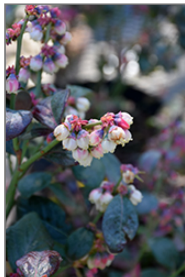
Pink Icing Blueberry flowers

* This is a 'special order' plant - contact store for details