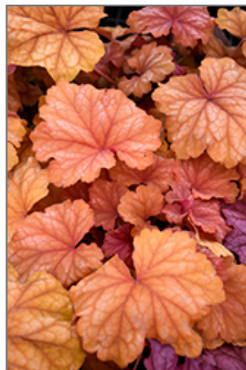
Champagne Coral Bells foliage

Champagne Coral Bells is recommended for the following landscape applications;