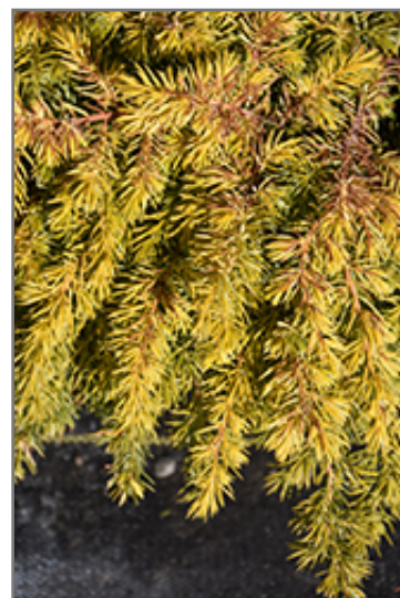
All Gold Shore Juniper foliage