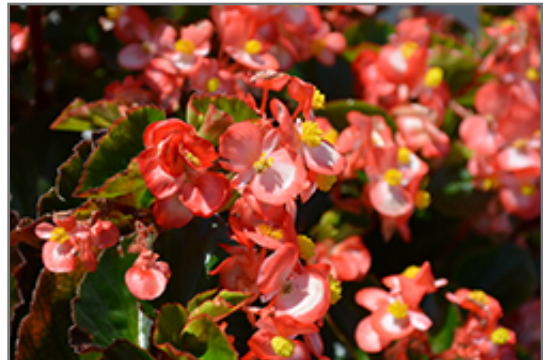
BabyWing Bicolor Begonia flowers

This is a high maintenance plant that will require regular care and upkeep, and usually looks its best without pruning, although it will tolerate pruning. Deer don't particularly care for this plant and will usually leave it alone in favor of tastier treats. Gardeners should be aware of the following characteristic(s) that may warrant special consideration;