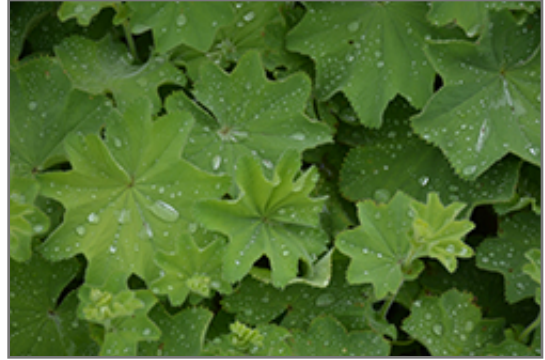
Lady's Mantle foliage

Lady's Mantle will grow to be about 18 inches tall at maturity, with a spread of 18 inches. Its foliage tends to remain dense right to the ground, not requiring facer plants in front. It grows at a medium rate, and under ideal conditions can be expected to live for approximately 10 years. As an herbaceous perennial, this plant will usually die back to the crown each winter, and will regrow from the base each spring. Be careful not to disturb the crown in late winter when it may not be readily seen!