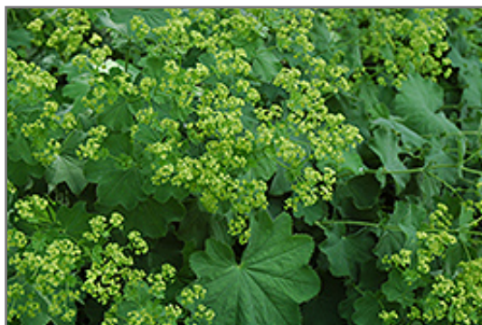
Lady's Mantle flowers

Lady's Mantle is recommended for the following landscape applications;